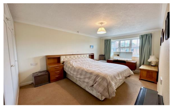
EPC RATING B COUNCIL TAX BAND D LEASE TERM 64 YEARS REMAINING SERVICE CHARGE £2536 P/A